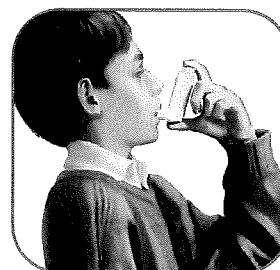
Inhaler in the mouth

TIP: A spacer makes it easier for some people to take their inhaler medicine correctly. Ask your doctor or pharmacist for help if you are having trouble using your inhaler.